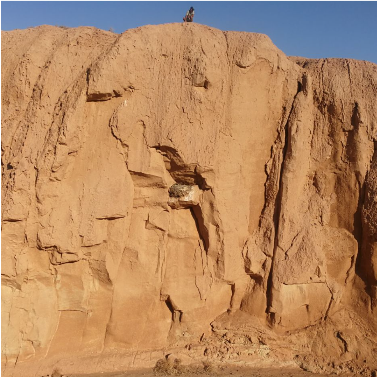
Photo 1. Valentin looking down towards an Egyptian Vulture nest in Bukantau where two chicks were tagged.