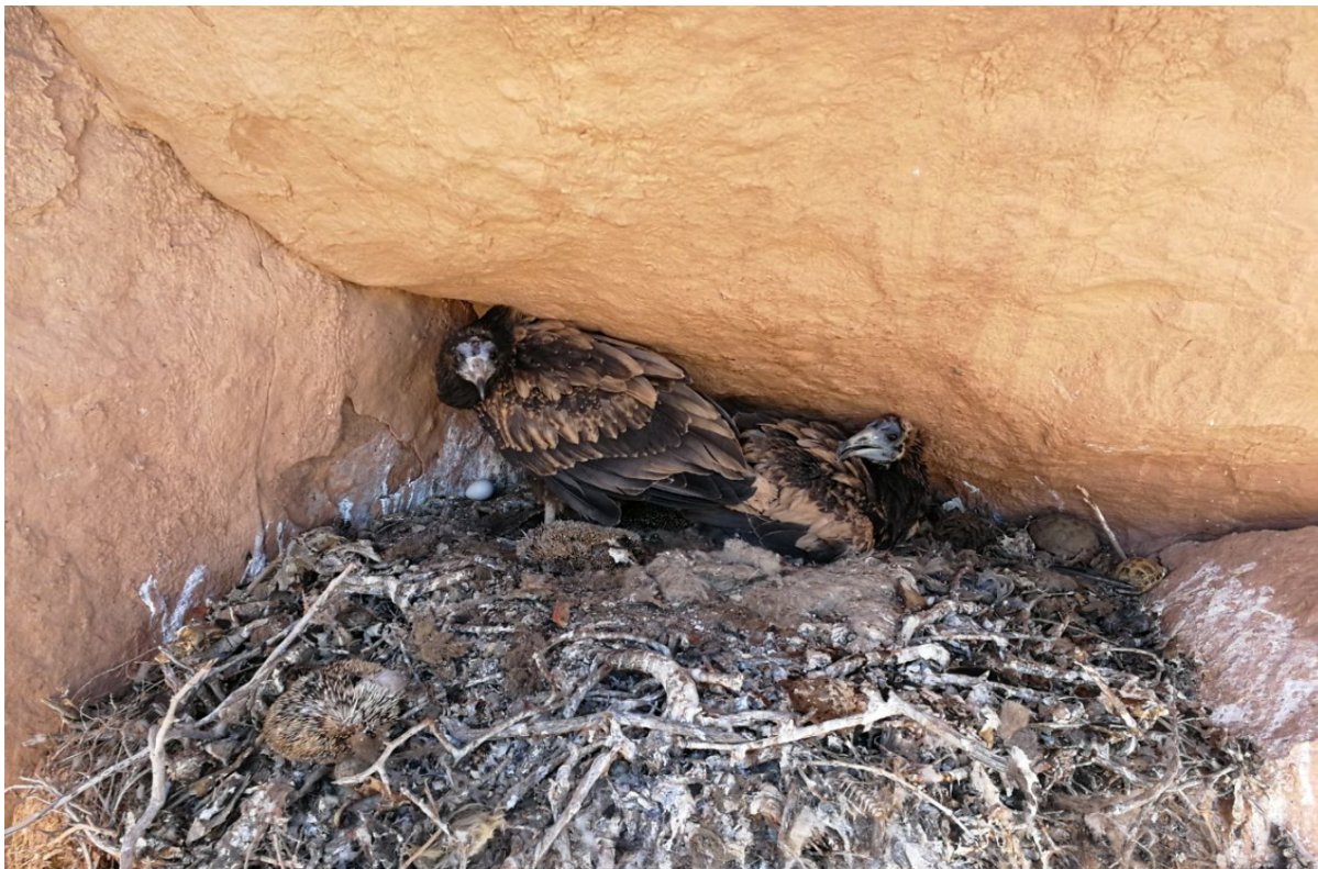
Photo 2. Timur and Bukhara, chicks tagged in the nest from Photo 1.